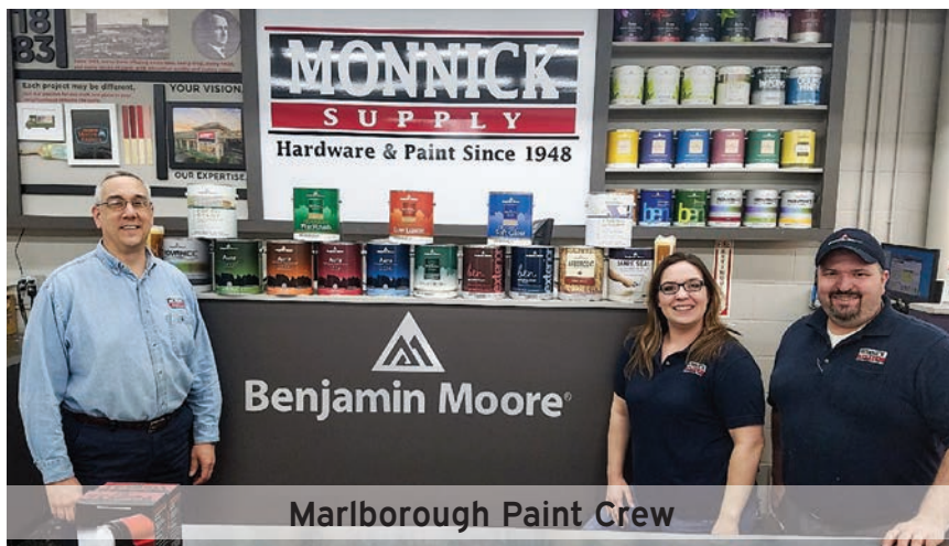
Marlborough Paint Crew