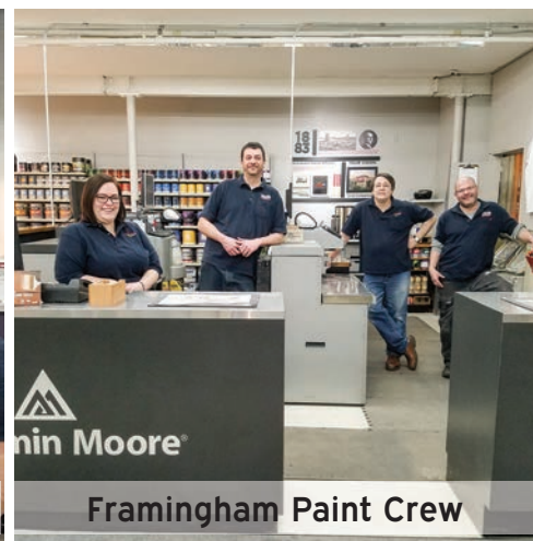
Framingham Paint Crew

Come in & check out our newly remodeled paint department!